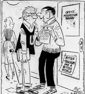
WHO SAID HE WONT CHANGE A GRADE? I GOT HIM TO RAISE THIS PAPER FROM A ZERO TO AN 'E'.