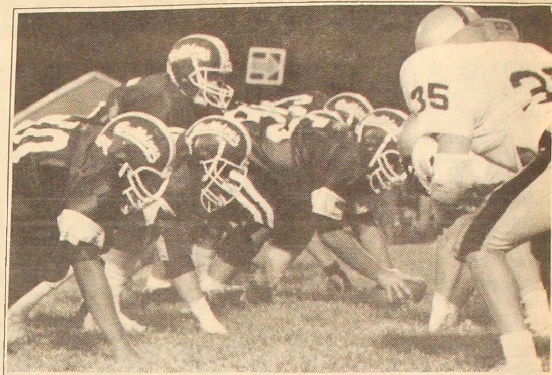
All fall sports teams, including the football Bulldogs, will be lining up for practices and early season competition after students return to campus Aug. 29.