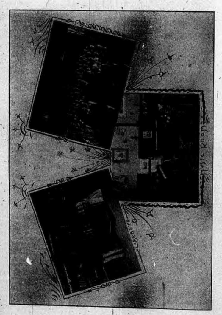
Interior Views of McPherson College.