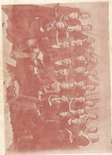
1889 THE K. K. VANHORN'S ALPHABETICALLY CLASSIFIED