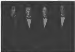
VARSITY MALE QUARTETTE