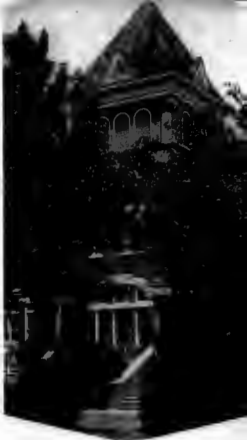
THE GREAT GORHAM HIGH SCHOOL