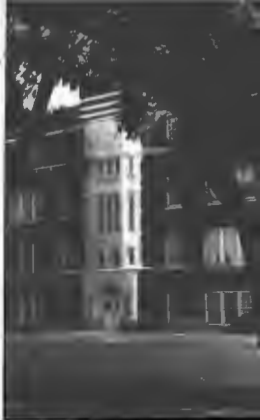
EARLY SCIENCE HALL.