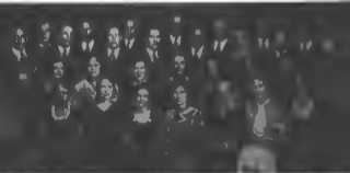
A CAPPELLA CHOIR