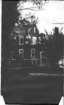
THE COLLEGE CHURCH.

A Place for Rest, Worship and Inspiration.