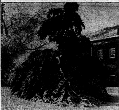
Freezing rain Saturday and Saturday night caused considerable damage to trees and power lines on campus in one of the worst ice storms in the history of this area.

By Your Door Or At Your Store Always Insist On Select Dairy MILK AND ICE CREAM Call CH 1-3820 For Home Delivery And Special Events 217 S. Main McPherson, Kansas