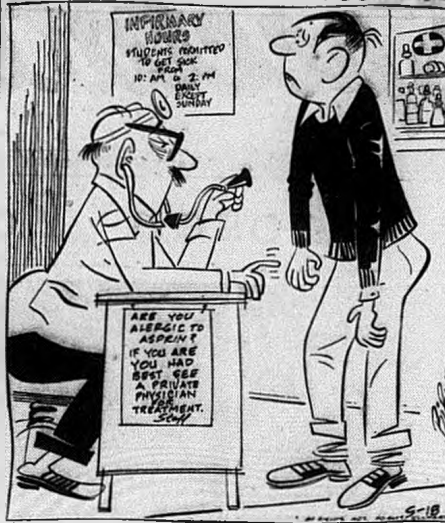
"WELL, WHY DON'T YOU TRY CARRYING YOUR BOOKS IN THE OTHER HAND?"