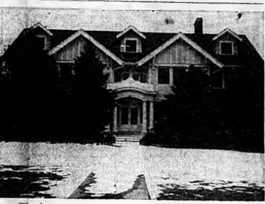
The large and spacious Vanman mansion, located at 1130 East Euclid, is to become a fine arts center for McPherson College.

Many churches of McPherson have invited her to sing in their services and she has received many recognitions for achievement in voice.