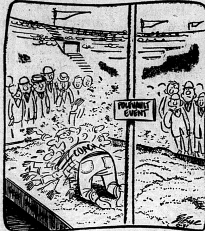
'EDDIE! EDDIE BOY!—YA JUS SET A RECORD! WHERE ARE YA EDDIE!