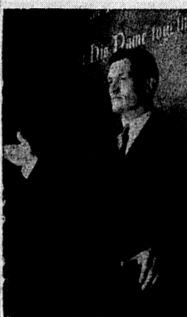
Rev. Bob Richards, member having heard Rev. Richards at the National Youth Conference in Anderson, Ind., in 1954. Bob also gave a pole-vaulting exhibition at Anderson.

Between May 1 and May 15, each extra curricular organization will vote on these four. Each organization gets two votes, one for one boy, and one for a girl.