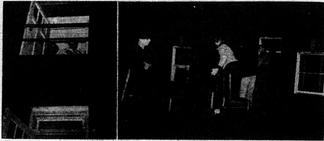
The above pictures show McPherson College students removing chairs from the library and girls looking on in expectation of three girls looking on in expectation of more invaders during a dorm raid. All this and more took place during a Halloween escapade last Monday night. The chairs were retrieved later the next day from the balcony of the Men's Dorm.

three girls looking on in expectation of more invaders during a dorm raid. All this and more took place during a Halloween escapade last Monday night. The chairs were retrieved later the next day from the balcony of the Men's Dorm.