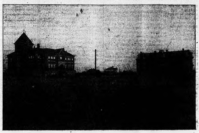
That we have a progressive college in a progressive city is proved by the shove pholographs. Above is a view of the west side of Main Street, between Marlin and Kransas Avenue, taken in 1880, about the time of the founding of the college. Below is the campus as it appeared twenty-five years ago.

I am not a heathers Yet I adore: pay tribute to, That which is not Belty, My worship is not of a mement, Nor of a day: Time is the wrong unit of mea-