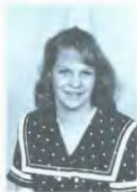
LEANN JOHNSON ELEMENTARY/SPECIAL EDUCATION