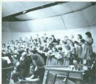
Above: The Concert Choir and orchestra warming up before their performance of Handel's "Messiah."