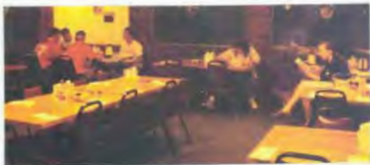
Above : Some students are at Happy Chel studying for those major tests that all collage students have.