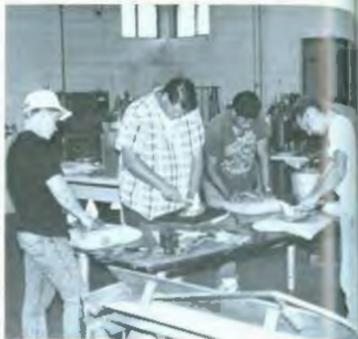
Above: These four are busy shaping out a car body part.