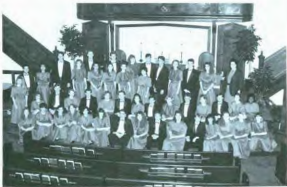
The McPherson College Concert Choir in the sanctuary of the Church of the Brethren.