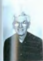
JIM EDWARDS AUTO RESTORATION TECHNOLOGY