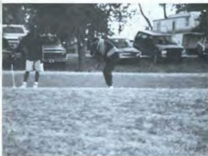
Left: Early fall golf at Lake Wassey.