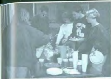
Above: Some of the residents checking out the goodies at the food table at the Courts pot-luck.