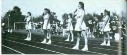
Above: The Football Cheerleaders leading the spectators to cheer on the defense.