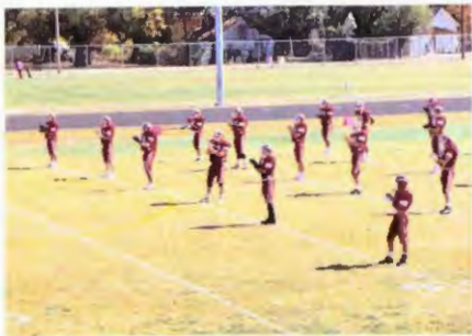
Right: The football team prepares to stretch while getting each other pumped up.