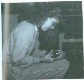
Below: The Auto Restoration department taking the opportunity to show the results of their hard work.