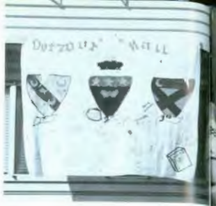
Above: After the time consuming task of putting together a banner, Dotzour residents show it off at the Homecoming Fair.