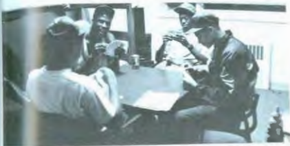
Above and Right: "The Metzler National Pastime."