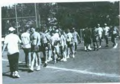
Right: The two opposing teams shake hands after the championship game.