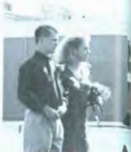
"The Homecoming Candidates for 1991-1992 are:"