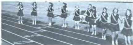
Above: The dance team performs at halftime of the Homecoming game and does it with style.