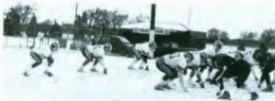
Above: The offense lines up to run a play in one of the most memorable games that most players will ever play in.