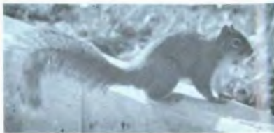
Above: "Spock to ENTERPRISE. Captain Kirk, there is intelligent life here. Recommend the Prime Directive, let this species evolve without human interference."