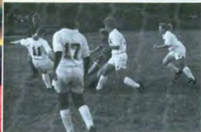
Left: Members of the Women's Soccer team showing their stuff.