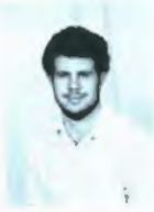
BRENT WINE TECHNOLOGY