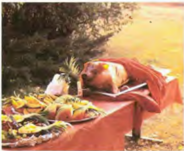
Left : The main course wonders when the show is going to start because she is ready to do some dancing.