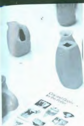
Above: Work in progress, shaped by a master's (or near master's) hand.