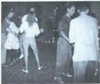
Above: One of the many dances sponsored by Stucco and SAB.