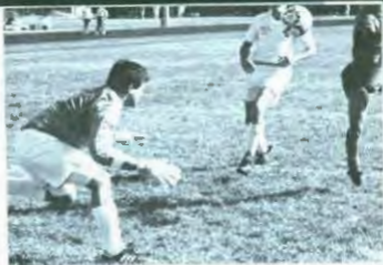
Top: The McPherson Goslie in defense of the opponents attempt to score.