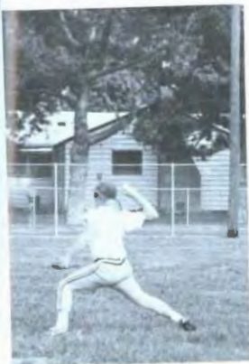
Below: Fielding action during a waterslide baseball game.