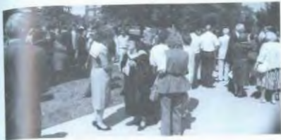
Left: Everyone is enjoying the perfect day that Mother Nature provided for the Class of '92.