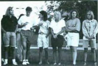
Above: Members of the Women's Tennis Team are being introduced at the Activities Fair.