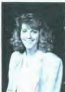
LAURA SCHERBARTH ELEMENTARY/SPECIAL EDUCATION