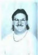
JAMES L. CHANEY TECHNOLOGY