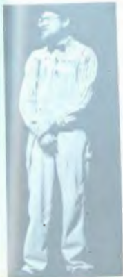
Right: The Parable Players display their versatility as entertainers.