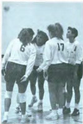
Above : Members of the team take a time-out to discuss their game plan.