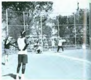
Above: More softball activity.