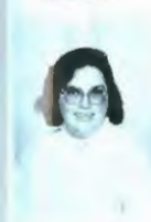
DIANE E FEASEHISER ELEMENTARY/SPECIAL EDUCATION