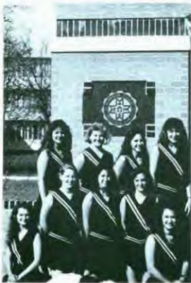
Below: The Dance Team goes through a routine at the halftime of the Kansas Wesleyan game.