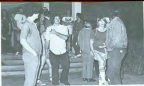
Spectators gather in front of Metzler in the wee hours of the morning to discuss McPherson College's latest spectator sport — strolling.