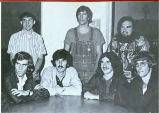
Metzler men join in raising funds for S.U. renovation drive