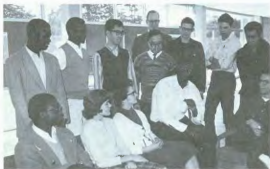
I. R. C. members pose for picture in Friendship Hall.