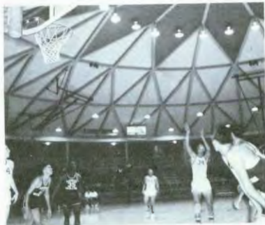
A free throw is attempted by Macollege.