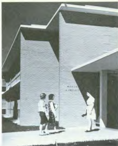
Mohler Hall controls the flow of grades, money, and administrative affairs.

Installation of air conditioning in the Student Union brought this cool comfort to a total of four buildings. Finally a dream came true when the Student Council organized a walk-in book store in the Student Union.