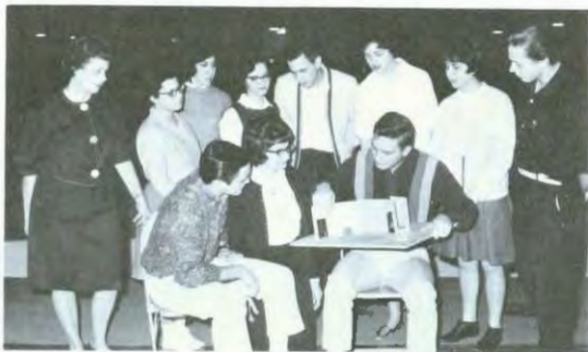
Some of the cast and production staff look at a model of "A Doll's House."