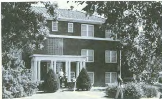
Kline Hall conditions young married couples for present happiness and for future years.