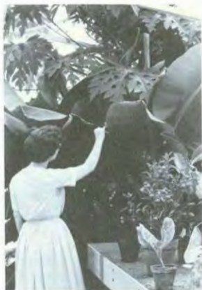
Banana tree in greenhouse attracts attention.