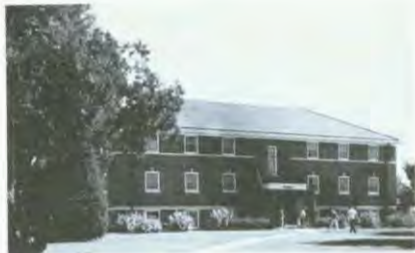
Fahnestock Hall continues to serve as a dormitory for some of the Maccollege men.