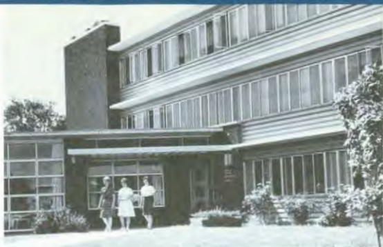
Dozour Hall conceals the women of Maccollege and their secrets behind glass and brick walls.