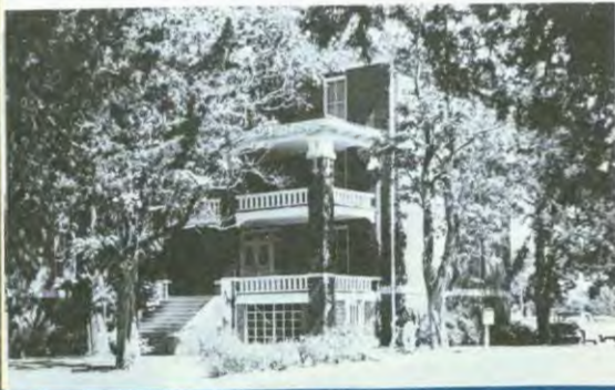
Arnold Hall collects college men on two floors and houses the Art Department.