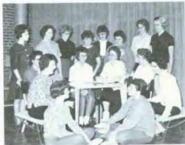
W.A.A. girls meet in Dotzour Lounge to discuss points.