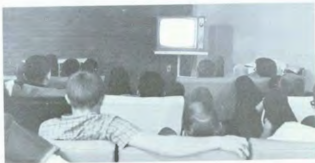
Metzler boys watch "Outer Limits" in the privacy of their television lounge "off limits" for Dotsaw girls.