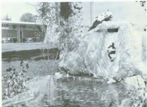
The Sophomore Class used a waterfall to portray "The Swedish Fall."