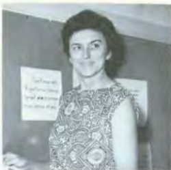
VERDA DE COURSEY Design