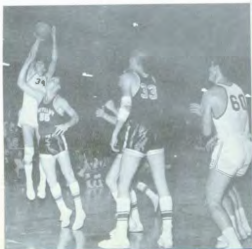
McPherson tries hard to defeat Bethany College.