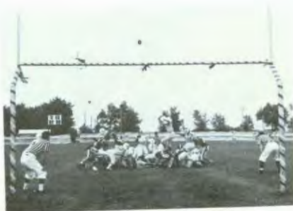
The Bulldogs try for the extra point in the homecoming game with Bethany.