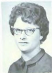
DALLAS WINE Agriculture