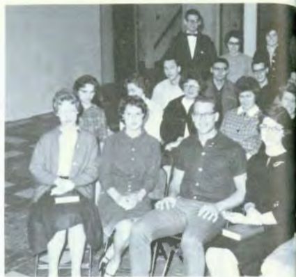
C.B.Y.F. members prepare for a program at the church.