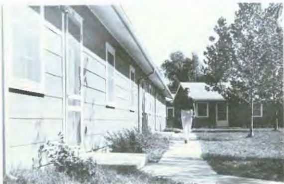
College Courts, at the northeast corner of the campus, consist of young married couples and their families.