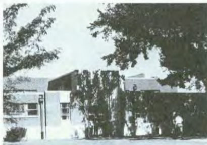
Physical Education Building conditions the Bulldogs for physical fitness.