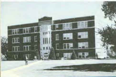
Harnly Hall combines scientists, homemakers, musicians, and linguists.