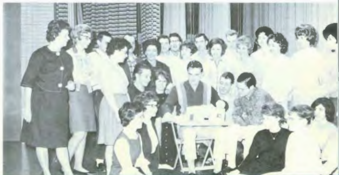
Players Club looks at a model of "A Doll's House."