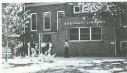
Beeghly Library challenges the students on research papers, collateral reading, and projects.