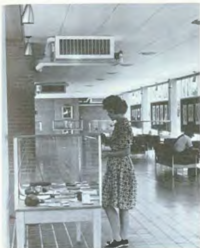
Jessie Brown Auditorium and Friendship Hall contain the cultural displays.