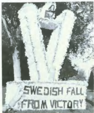
The "V" portrays the desired Bulldog homecoming victory.