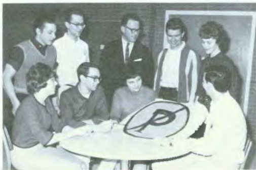
German Club members talk over plans for the forthcoming Kostume Karnival.