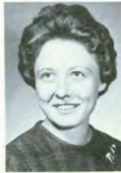
JOHN HARRISON English