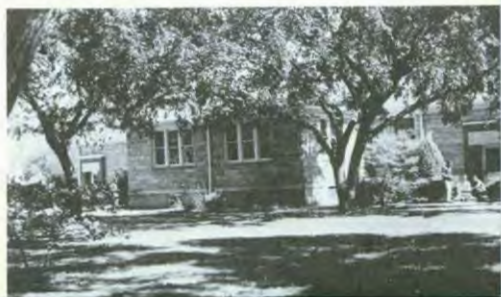
Frantz Industrial Arts Building cultivates the manual arts and agriculture.