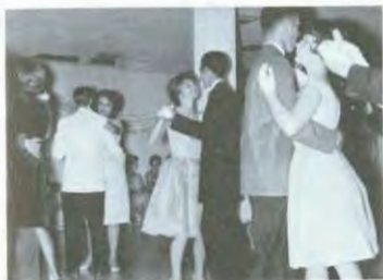
The Queen's Ball added to the homecoming festivities.