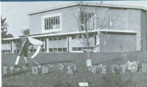
The Junior Class won the first place with "Rake Up a Victory."