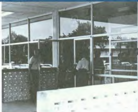
Student Union caters to students at meal time and during their spare time.