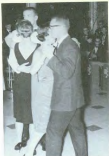
Two couples dance to music provided by the Sage Band.