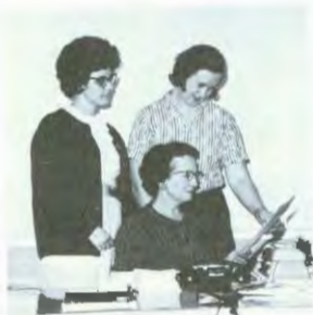
EDYTHE EIS Development Office