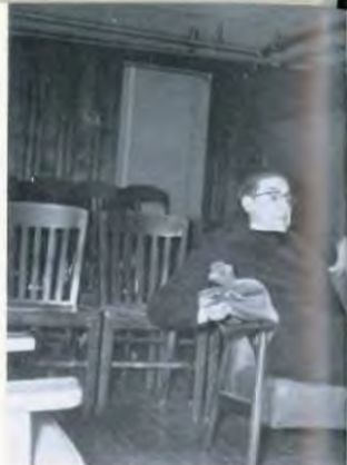
The characters enjoy tea.