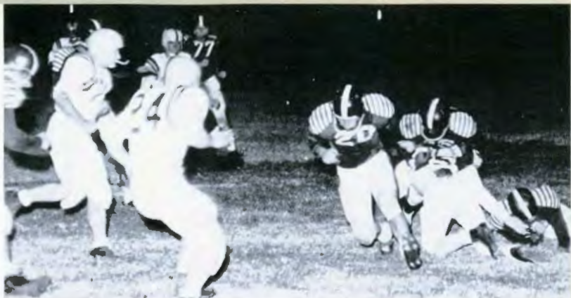
Ragland carries the ball for a gain on the play.