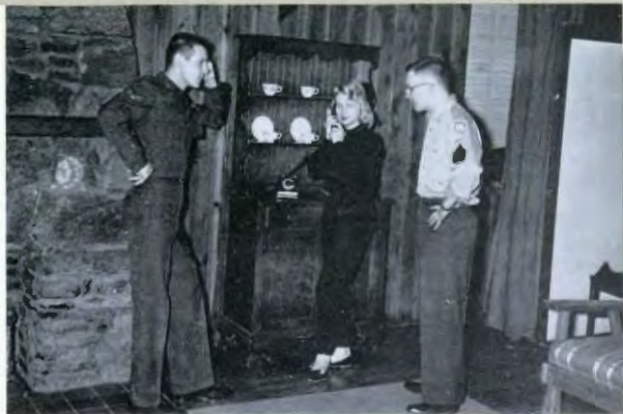
Word of an escaped spy complicates matters!