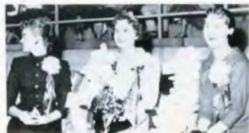
The Queen and her attendants watched and discussed the exciting game.