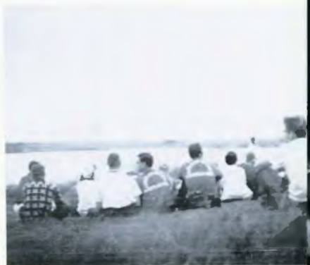
The group sang as they looked over the lake.