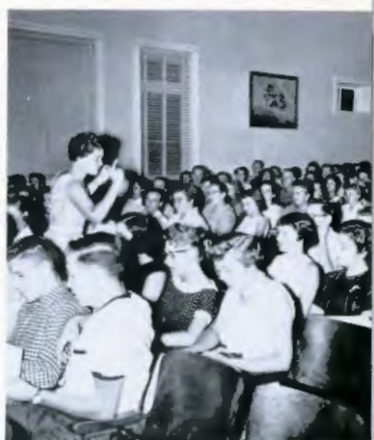
"It came out right!" Dais led the group in rounds and songs.