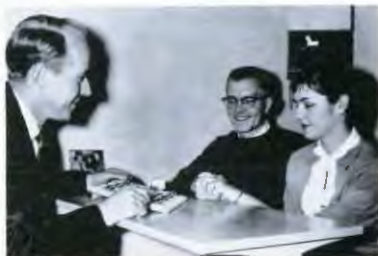
Exquisite originations in engagement rings.