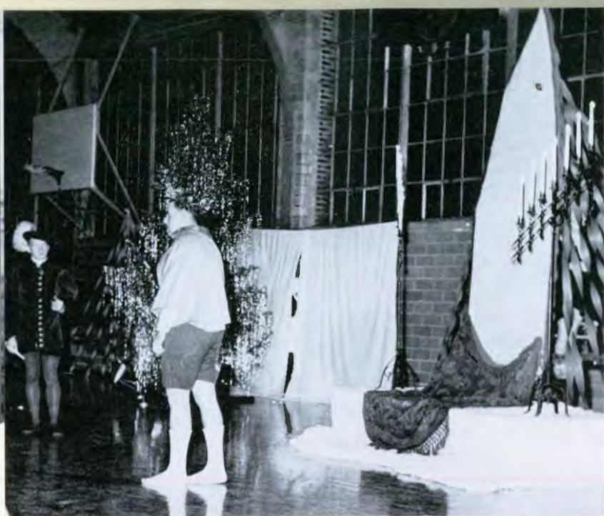
The spirit of Christmas lights the world.