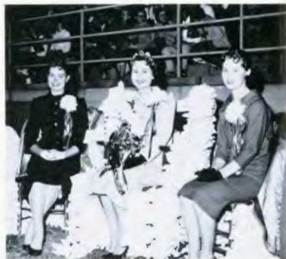
The royal party at the game.