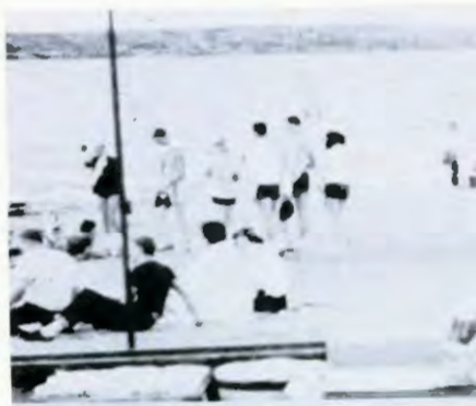
The college students enjoy the sandy beach.

Kanopolis Lake was the site chosen for the all-school picnic in September. The Social Committee was responsible for a weiner roast on the beach, and the Recreation Council provided games. A short but inspirational worship service, held on the hill looking over the lake toward the sunset, brought the picnic to a close.