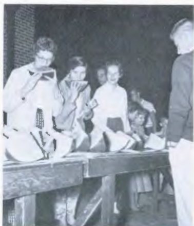
Members of the M Club serve the watermelon feed in "high" fashion - no forks, no towels!