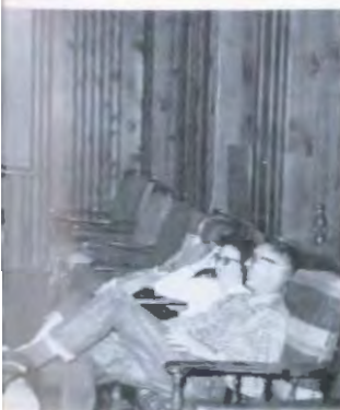
The "recreation parlor" of Mac college.