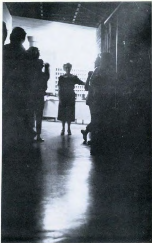
"Good night, ladies. It's time to leave you now."