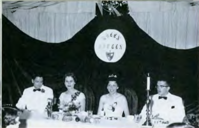
The Queen at her court.

Mac campus started "coming alive" with preparations, floats, the banquet, arrival of former grads, and finally the victory over Kansas Wesleyan.