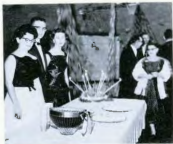
Cake and punch were served by the committee.