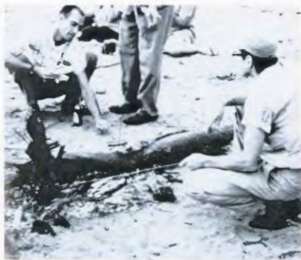
Food! It is better when you cook it yourself.