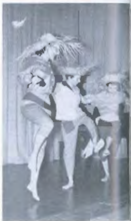
Talent? We all have talent is sometimes hidden.