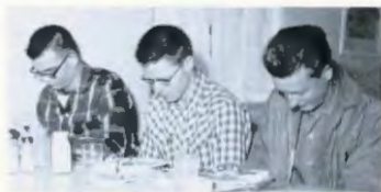
Each member of the college family takes time to bless his food.