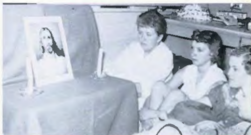
Third floor meets for its regular worship service.