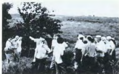
Nature lovers surveyed the beauty of the surrounding territory on a nature hike.