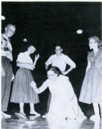
Freshmen were kept busy "marking up" points for their team!