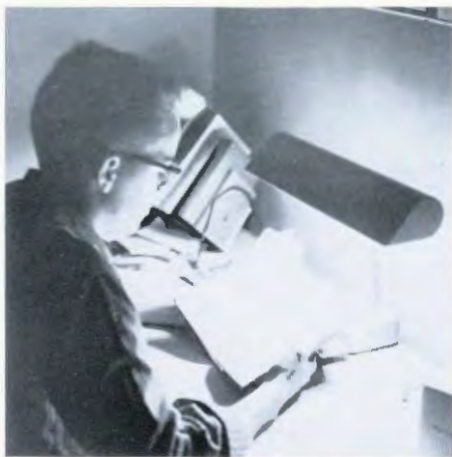
That few moments of personal devotion a day keeps college tension away.