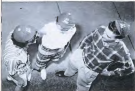
"Do we have to" Freshmen connive against the court.

Freshman initiation is under the direction of the initiation committee, a group chosen from the Student Court. This committee sponsors the wearing of the red beanies and the tug-of-war between the freshmen and the sophomores. Each freshman is to wear his beanie until the tug-of-war, and if the freshmen lose, they must wear them one more week. These rules may be enforced by the initiation committee.