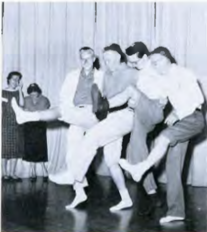
Consequences of the conniving!