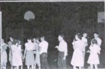
Faculty Reception. Prize winners at the Freshman Senior Kid Party. Only aissies and movie stars used forks. All join hands and circle left. Like pouring water down a rat hole. Freshman Senior Kid Party.