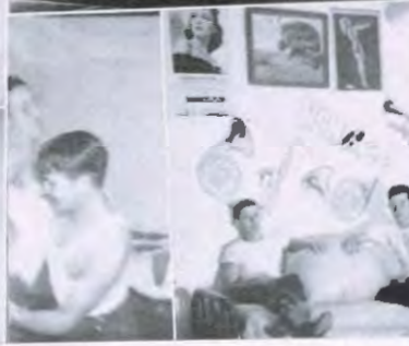
Weighty subject I'd say. Bettin' on the winner. Midnight snack. Is Dell studying? Snug as a bug in a rug. Zzzzzzzz McCann. Whose room is that? Friendly battle. Typical college guys.