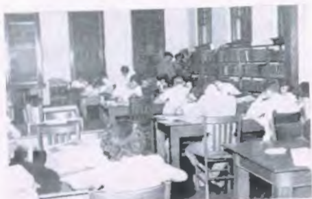
CARNegie IN USE.