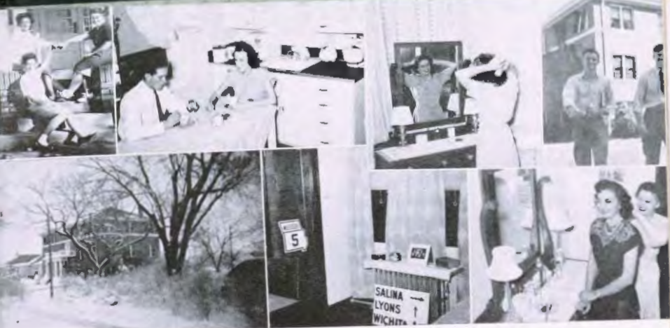
Just waiting for a man. Essence of domestic silence. Lethal grooming. Our aspiring carpenters. Kline through the buck brush. Gentry's room, no doubt. Correll's curls.