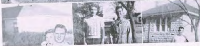
FRANTZ INDUSTRIAL ARTS BUILDING See munsingwear advertisement. For whom the Bell Tolls. Our Pennsylvania Baker.