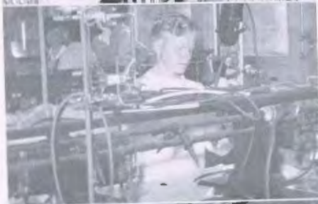
COLONEL AND THE NATURAL SCIENCE CENTER.