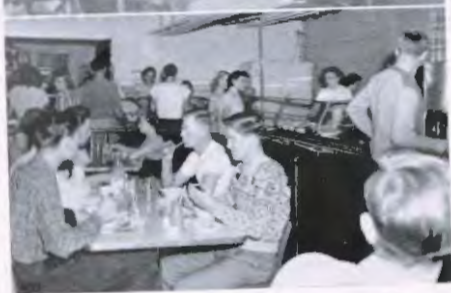
MAN SHALL NOT LIVE BY BREAD ALONE.