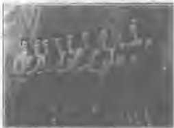
Basket Ball Team 1914.