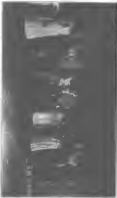
Portrait of a person in a dark setting