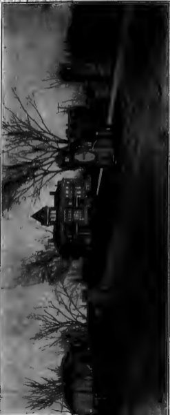
View of McPherson College