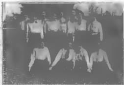
Y. W. C. A. Cabinet.