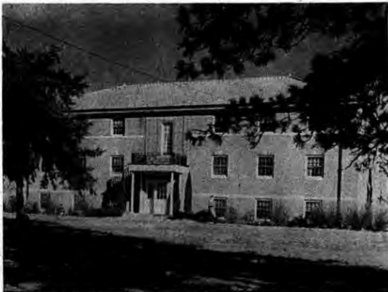
FAHNESTOCK HALL —a fine mens' dormitory with modern furniture and decoration throughout. A real home for men away from home.