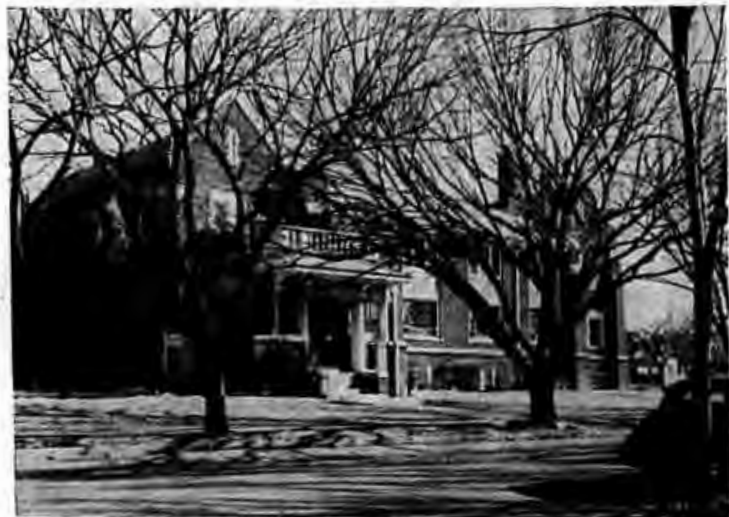
COLLEGE CHURCH —the center of inspiration and worship of the college. Its beautiful stained glass windows live with the students long after graduation.