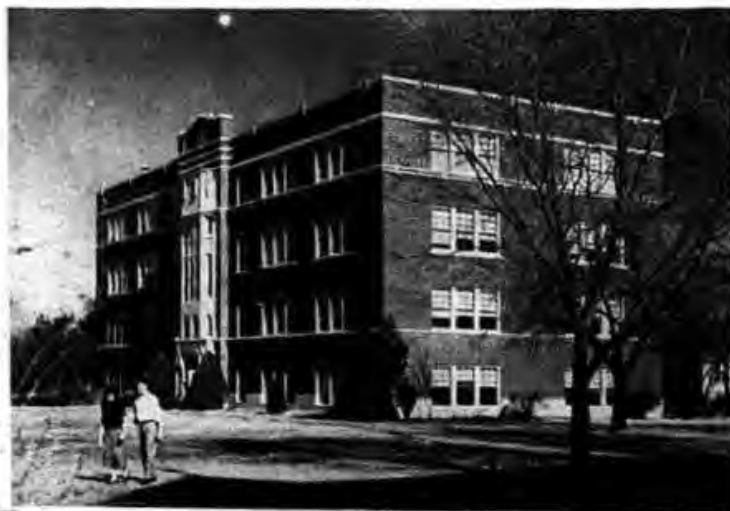
SCIENCE HALL—a modern classroom building with well equipped laboratories. Chemistry, biology, physics, math, and the social sciences are taught here.