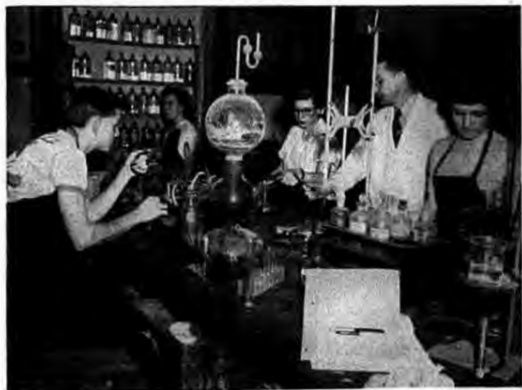
Classes at McPherson are kept small so as to provide maximum individual instruction. Equipment is up-to-date and very adequate.