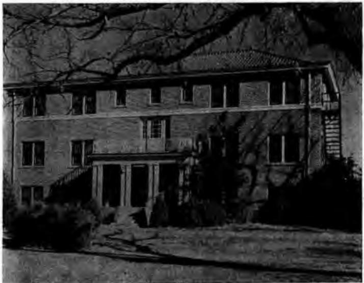
KLINE HALL —a combination apartment building for college married couples and a girls dormitory. It has a very homelike atmosphere and a very informal life for all.