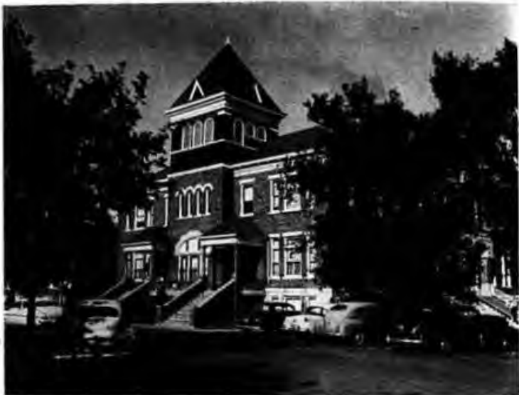
ADMINISTRATION BUILDING—within its walls are the administrative offices, auditorium, and several classrooms. It is also the center of student activities.