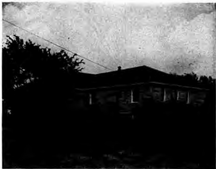
INDUSTRIAL ARTS AND AGRICULTURE BUILDING workmanship with drawing board, wood, and metal are taught here. Future farmers learn better agricultural methods.