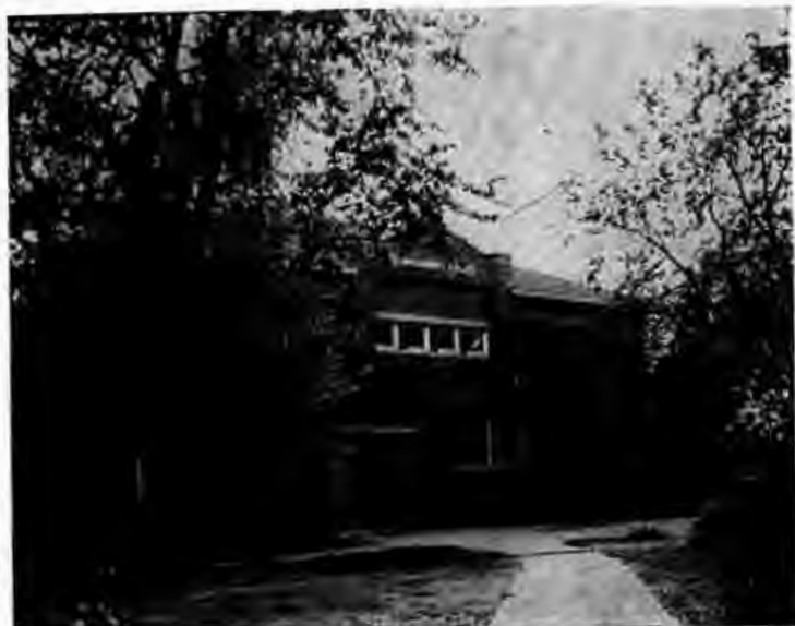
LIBRARY —One of the best equipped libraries in the midwest. Originally a gift of Andrew Carnegie it was enlarged and completely modernized in 1950.