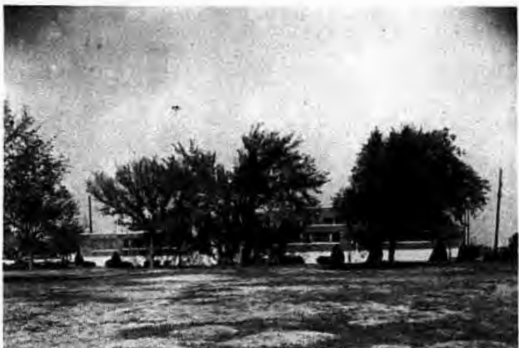
GYMNASIUM —a beautiful building with a large playing floor and well equipped dressing rooms. The fine stadium behind it gives a splendid athletic plant.