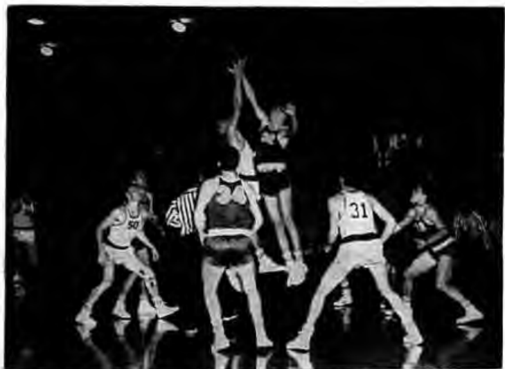
The thrill of competition on the Kansas Conference floors is an anticipated experience of both participants and spectators.