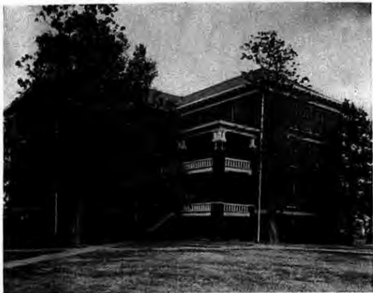
ARNOLD HALL —a large well equipped dormitory which provides for 66 men and also space for a modern cafeteria.