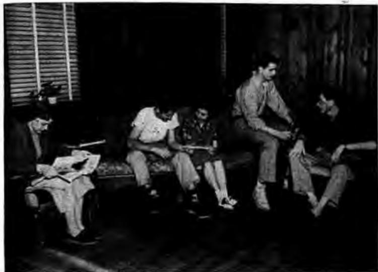
McPherson College is friendly and informal. Students of every state and every nation meet here to make lasting friendships.