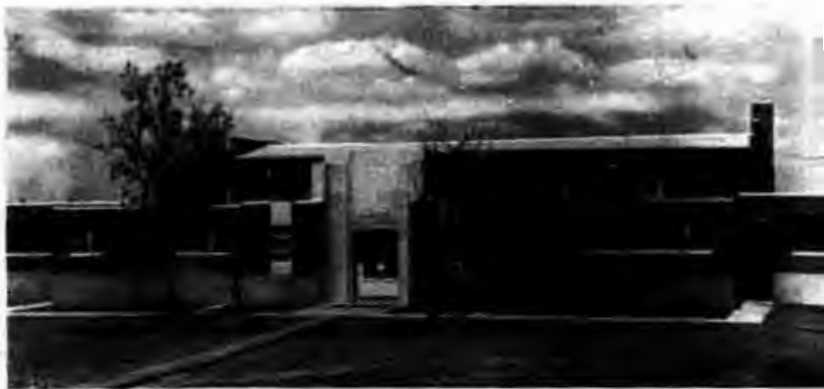
PHYSICAL EDUCATION BUILDING