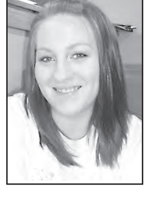
"Slightly hung over but excited for the club and the weekend."