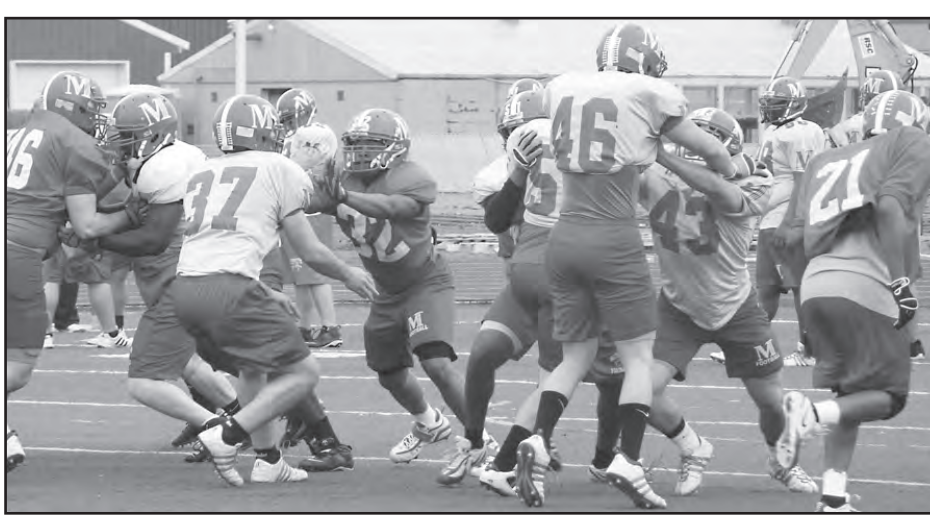
Football team practices on April 16 for its scrimmage on Saturdayy April 18.