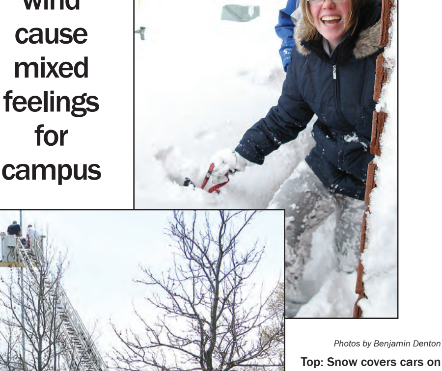
Top: Snow covers cars on