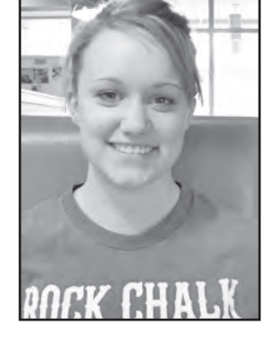
"Stressed but excited for summer."