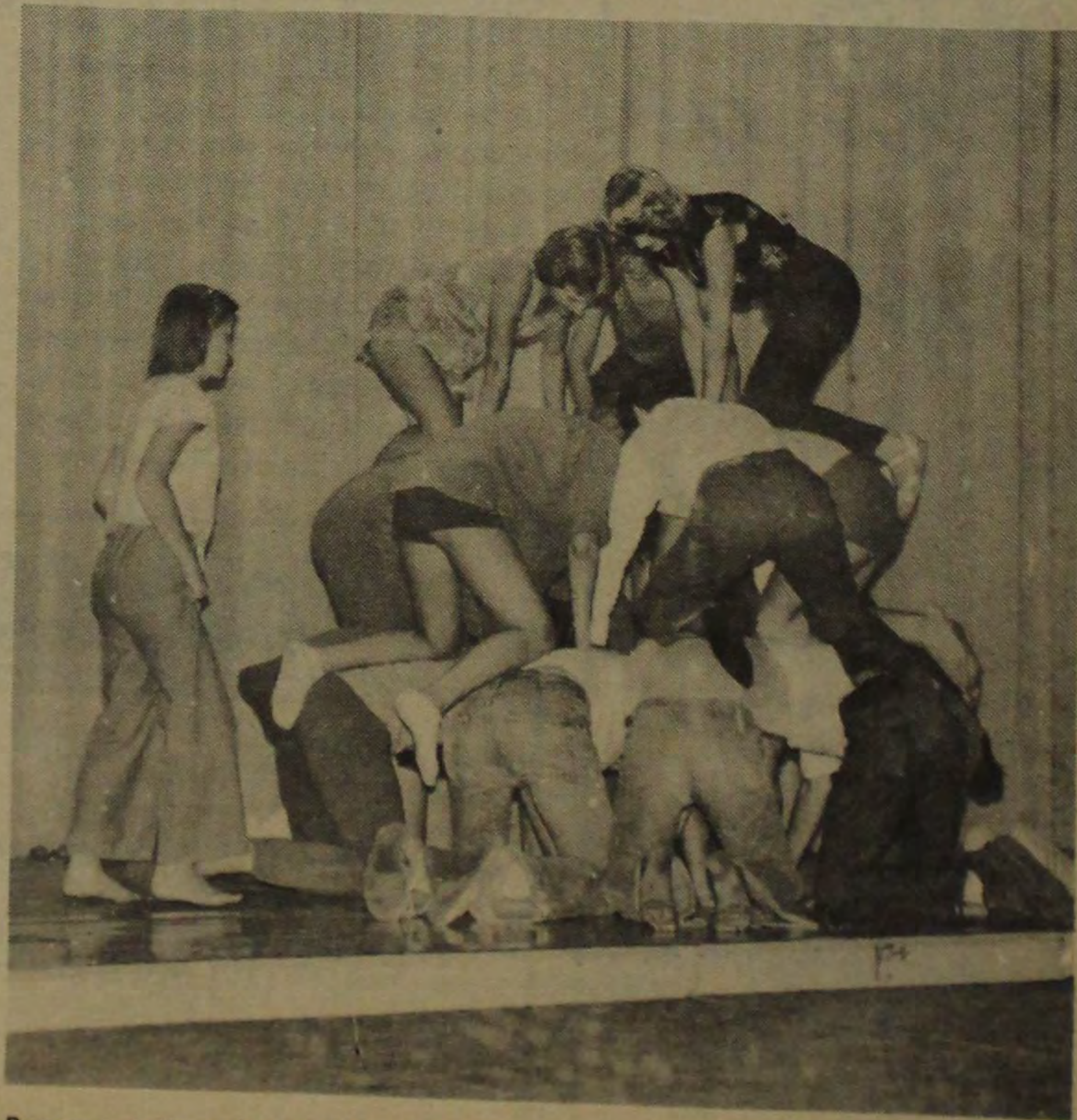
Representatives from each orientation group attempt to complete a human pyramid during an orientation exercise earlier this month.