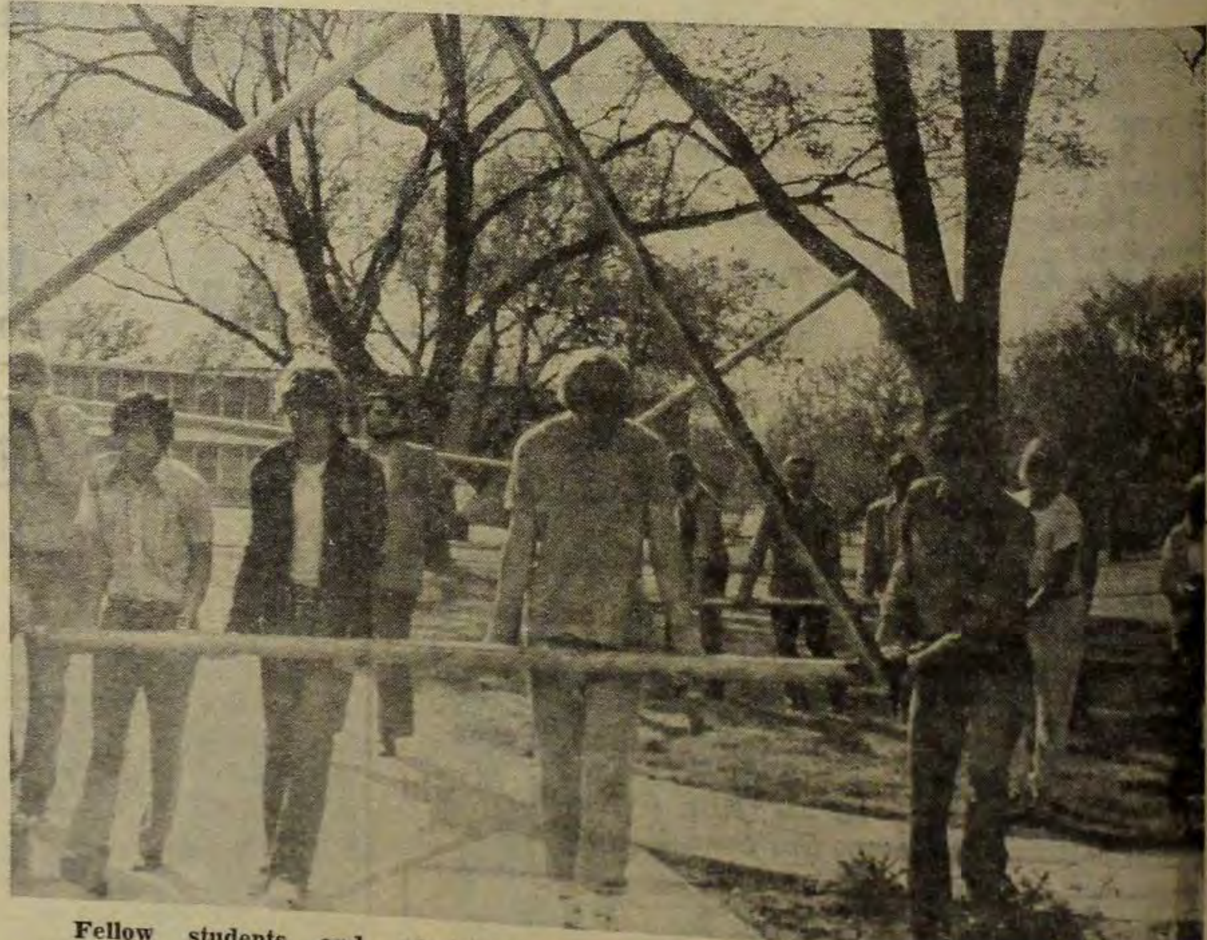
Fellow students and administrators help soccer players place their goals on the field for last Saturday's game with Bethany, which McPherson's soccer club won, 5-2.