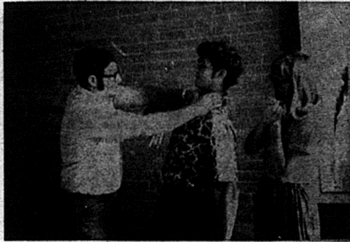
Sheriff Harold Strongheart protects the fair damsel Clementine from the mean villain Jackpot Slade.