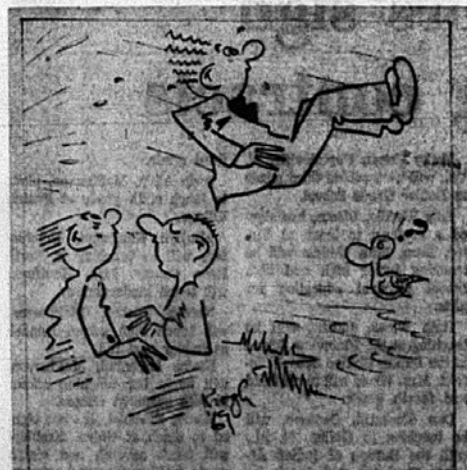
"IT'S ALWAYS BEEN A TRADITION HERE FOR THE NEWLY ENGAGED. IT'S ONLY RECENTLY, THAT THEY'VE THROWN THE PROFESSORS IN, TOO."