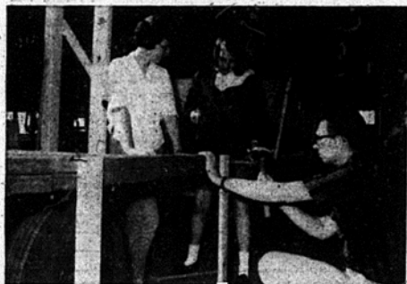
Sophomores perform their duty making a float for the May Fete Parade.