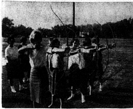
Hey! Wait a second, where is the professor? These members of the archery class are taking a more intense aim than a mere straw target would justify.