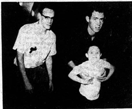
Members of the Macollege Skate Club combine service with fun by helping retarded children learn how to roller skate.