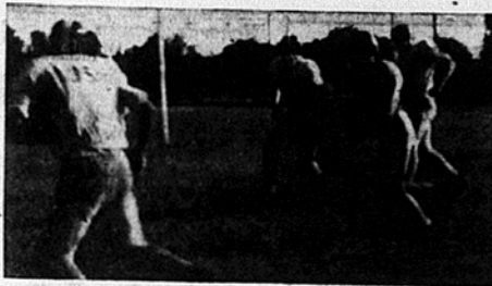
RIGOROUS WORKOUTS continue for the Bulldogs as they prepare for the College of Emporia contest tomorrow evening.