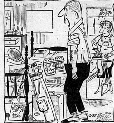
"POKER CHIPS, BONGO DRUMS, JAZZ RECORDS, PORTABLE HI-FI CARDS, GOLF CLUBS, TRANSISTOR! - SAY, ARE WE SENDIN' THIS KID TO A COLLEGE OR A COUNTRY CLUB?"

ville, Pa. "Maccollege has within its walls the potential to help our political dilemma if it can be sought out and encouraged to help."