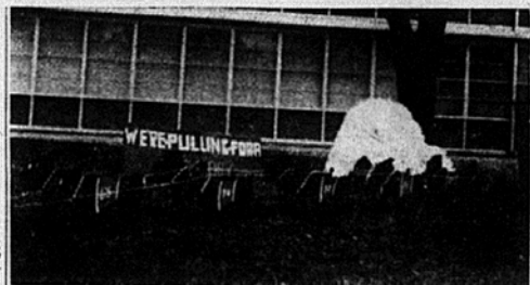
RECREATIONAL COUNCIL WON first prize in the Homecoming campus displays. Their award was $30.00. Winners were announced during half time of Saturday's football game.