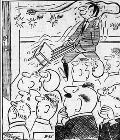
SOMETIMES I DREAD THESE LITTLE 'DEMONSTRATION' SPEECHES!