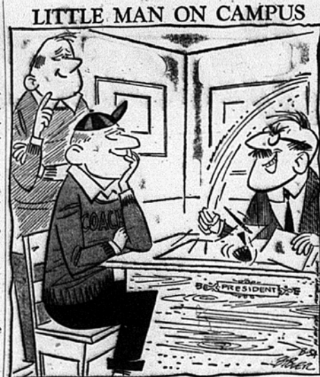
OUR ONLY SUBSIDY TO PLAYERS IS BOARD & ROOM; HOWEVER, GOOD PROSPECTS SHOULD BE MADE AWARE OF THE FRINGE BENEFITS: CAR, GAS, THEATRE PASSES, PRIVATE TUTOR.