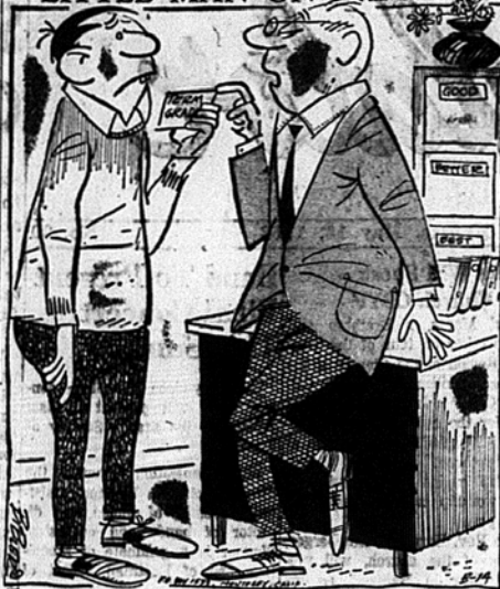
"I'D RATHER YOU DIDN'T CREDIT ME AS 'GIVING' YOU THIS 'F' — YOU EARNED IT."