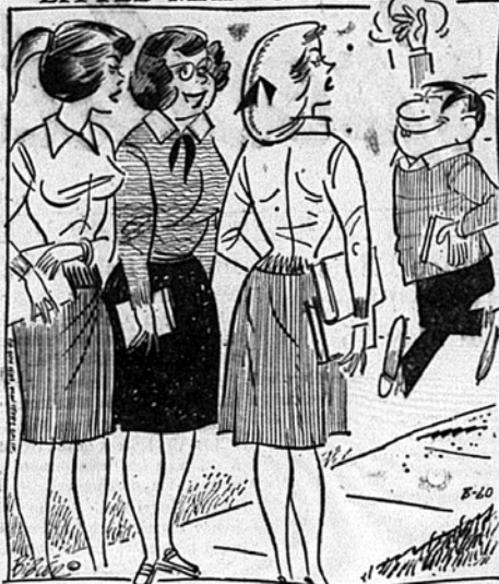
"I THINK HE PLANS TO ASK ME TO GO STEADY—HE ASKED MY HOUSE-MOTHER WHAT KIND OF GRADES I MADE ON MY OLD TERM PAPERS!"