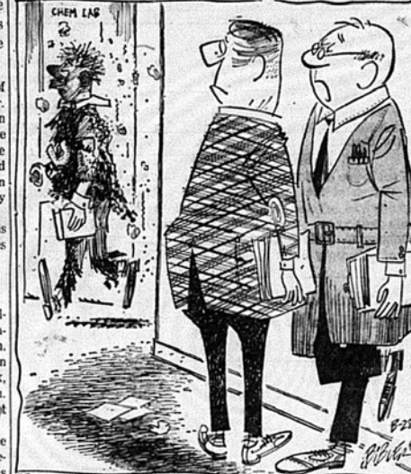
"BY THE WAY, DEAN, I'VE BEEN HOPING SOMETHING COULD BE DONE ABOUT THE SHORTAGE OF SUPERVISORY PERSONNEL IN CHEM 1-A."