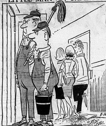
"PROF SNARF ALWAYS MANAGES TO SCARE SOMEONE WITH ONE OF THOSE SUDDEN EXAMS OF HIS."