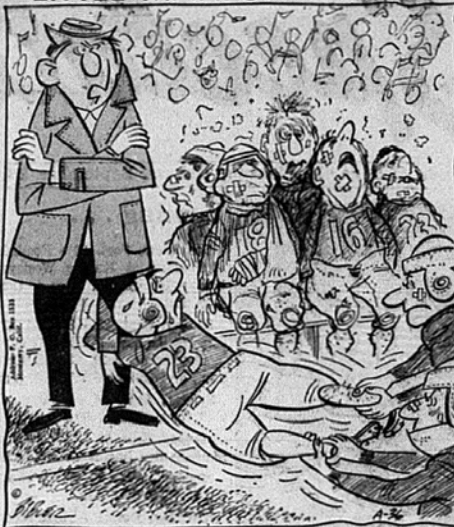
"NONSENSE, WE'RE ALL A LITTLE NERVOUS TH FIRST TIME WE GET OUT THERE TO PLAY."