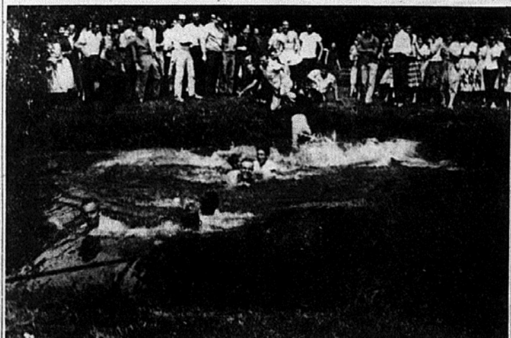
Freshmen boys got soaked as they were pulled through the water at Lakeside Park Tuesday noon as the sophomores won the annual tug-of-war. Besides getting wet, the freshmen now must wear their beanies until halftime of the Mac-KWU game tomorrow night.