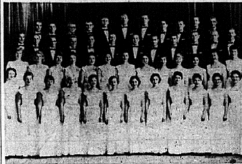
Westminster Choir from Princeton, New Jersey, will perform the College-Community Cultural Series.