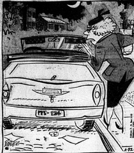
"NO WONDER TH' RUSSIANS ARE AHEAD OF US—BOTH OF YOU SHOULD BE IN THE LIBRARY STUDYING."