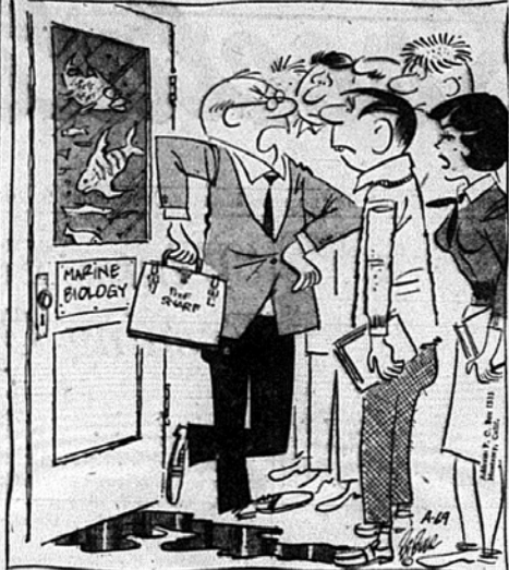
"ALL RIGHT! WHO LEFT THE WATER RUNNING IN THE SPECIMEN TANKS?"