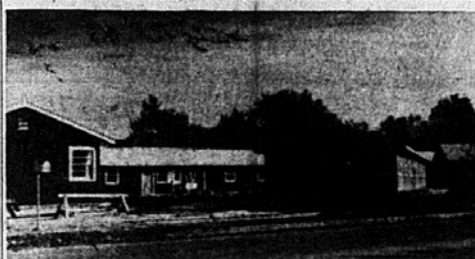
The new twelve unit housing addition to the College Courts is rapidly being completed. The new addition is to be completed by the end of the first semester and will provide housing for twelve married couples.

The cafeteria will be closed from Tuesday evening until Sunday evening, Nov. 27. The snack lunch which will be served Sunday evening is included in the Slater Food plan.