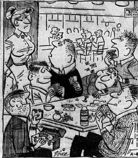
"BUT TH' COACH TOLD US TO START MAKIN' MORE USE OF TH' LIBERRY."