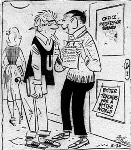
"WHO SAID HE WONT CHANGE A GRADE? - I GOT HIM TO RAISE THIS PAPER FROM A 'ZERO' TO AN 'F.'"