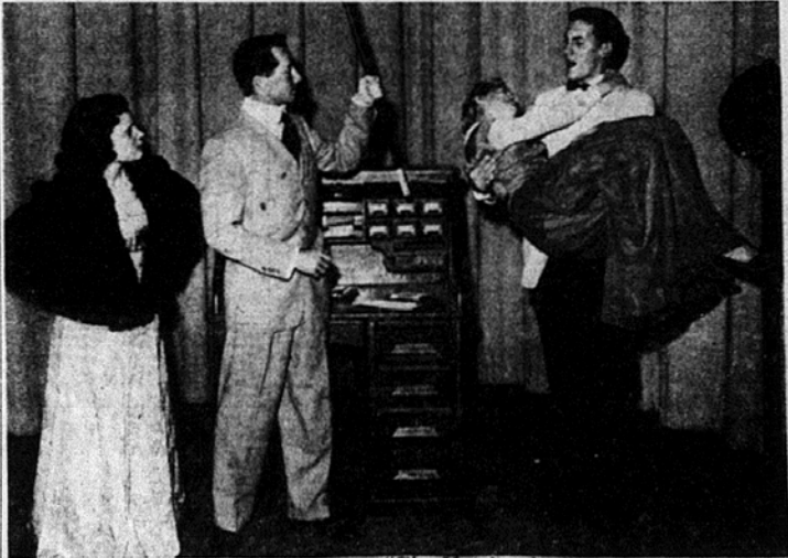
A scene from "The Matchmaker"

Friday, Dec. 4 — College-Civic Orchestra Concert in Chapel at 8 p.m.