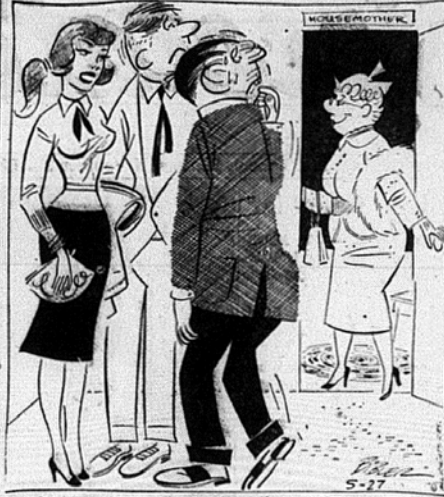
I FINALLY GOT A BLIND DATE FOR YOUR FRIEND HERE - WE CAN EVEN STAY OUT PAST CLOSING HOURS.