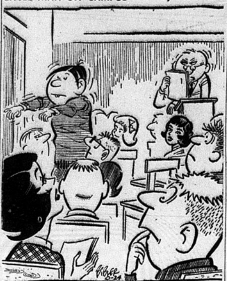
IN CONTRAST—DURING 600 A.P. THE ..... DURING 600.....THE..