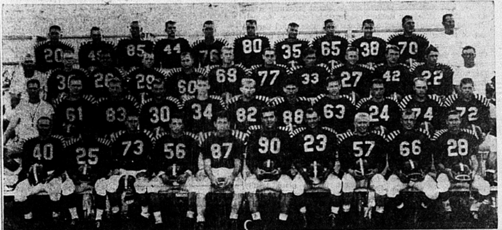
1958 Bulldog Football Squad