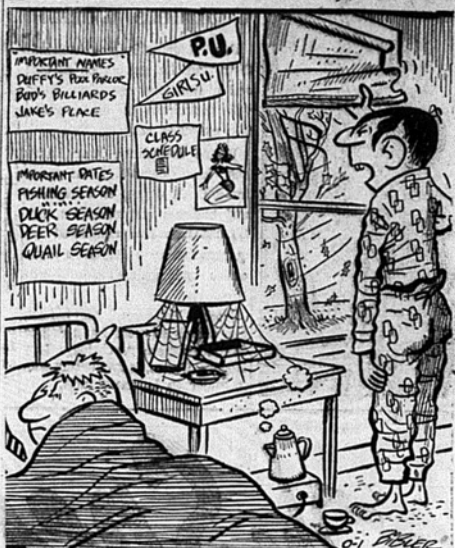
WITHIN TO DO ON A LOUSY DAY LIKE THIS—WHADDA YA SAY WE GO TO CLASS?!