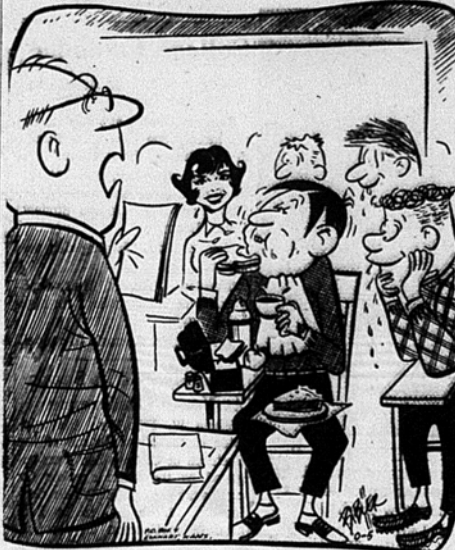
["SEE I'VE LECTURED INTO YOUR 'LUNCH HOUR' AGAIN."]