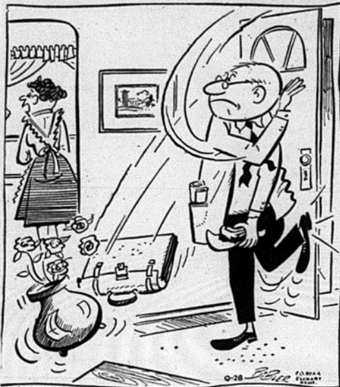
"HOW DID THE FACULTY MEETING GO, DEAR?"