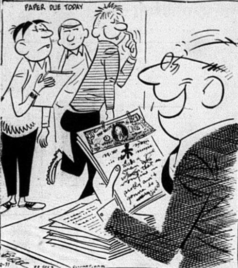
BURWELL - YOU'VE CERTAINLY IMPROVED THE PAPERS YOU'VE BEEN HANDING IN TO ME LATELY.