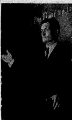
Rev. Bob Richards member having heard Rev. Richards at the National Youth Conference in Anderson, Ind., in 1954. Bob also gave a pole-vaulting exhibition at Anderson.

Teachers are expecting the largest attendance of any school function the whole year.