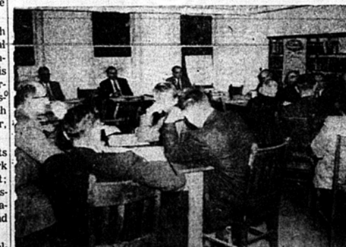
Maccollege trustees will be meeting next week to discuss college activities and hire next year's faculty. The trustees come from the entire Western Region representing the Church of the Brethren constituency.

As of now, 80 former choir members are planning to attend.