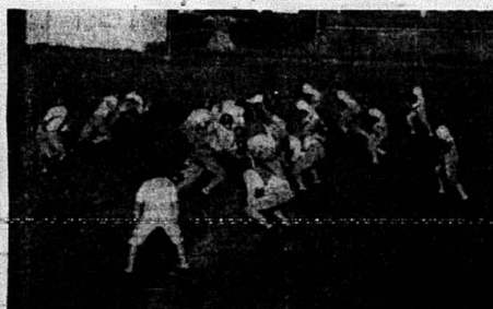
The Bulldogs in scrimmage practice. Guy Hayes, line coach (Jersey No. 47,) watches for faults on timing, and searches for weaknesses.

Casualties have been very few among the members of the squad.