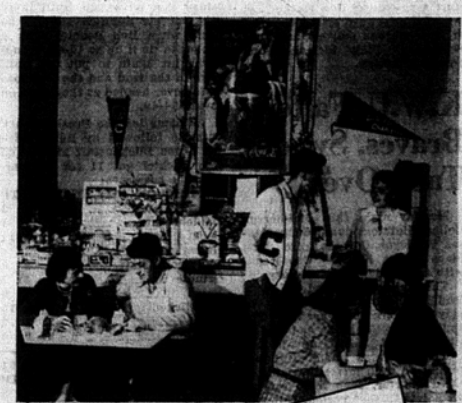
College Canteen College of Charleston Charleston, South Carolina