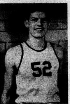
Jameson Stars Against K. W. U.

Ottawa will journey to Bethel Saturday night to meet the Gray-maroons, with the Braves likely to come out on top in that one.